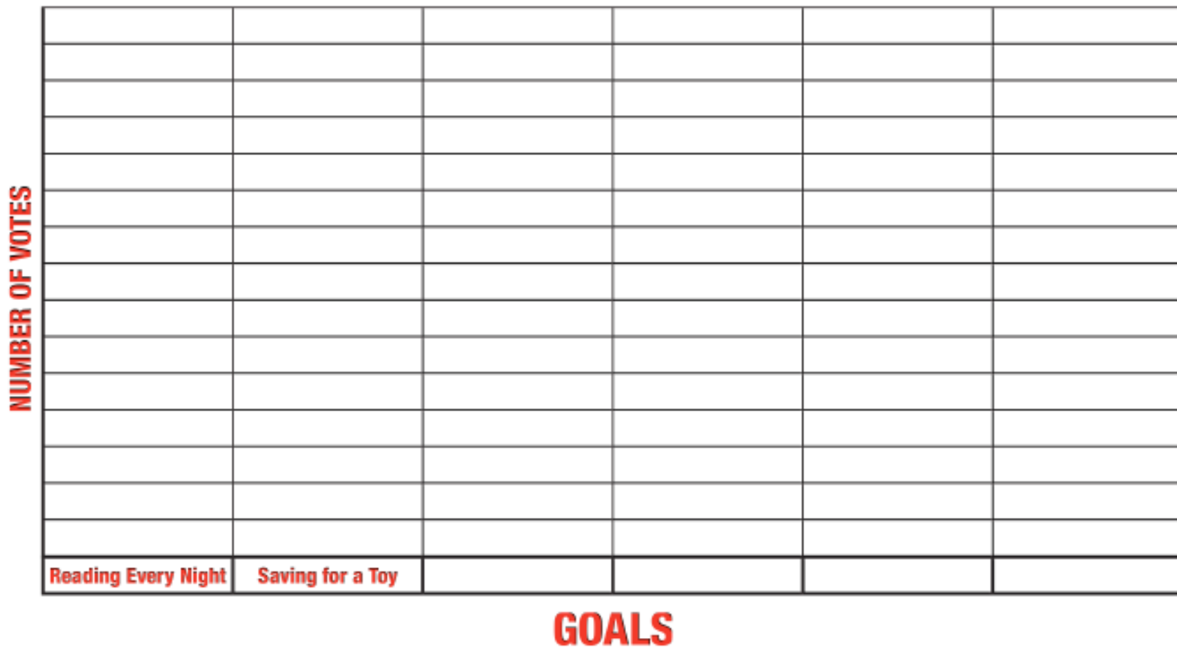
CHART: STUDENT GOALS